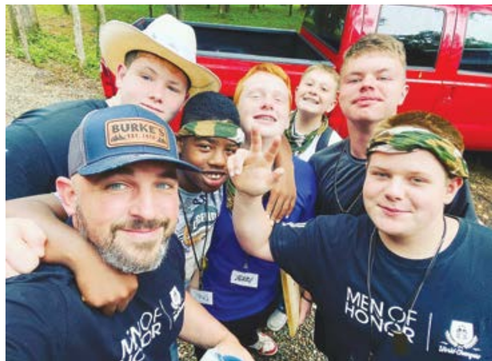
Sponsored article by Blue Ribbon News in collaboration with Men & Ladies of Honor.

For more information, visit Honor Ministries | Dallas ( honorchangeseverything.com ) or email weldon@themenofhonor.org .