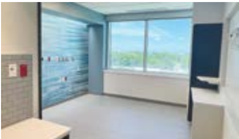
Photos above are views of the new spaces on the fourth floor, taken in July. The new fourth floor began serving mothers and babies in September.

The NICU and other renovated areas have spacious waiting rooms in light blue and gray tones. Wave features are painted on the walls, alluding to the nearby lake. These features are intended to instill a sense of calm. Most of the first floor is being renovated or refreshed. The facility’s front-line caregivers provided input into the design based on needs that came to light during the COVID-19 pandemic.